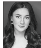
Vocalist & Saxophonist Aubrey Alvino United States