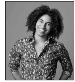
Dancer Malik Gray United States